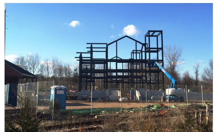
Construction of the new Berlin Station

-Began construction of east and west high-level platforms -Complete construction of east and west tower frames